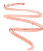
STAY IN BED