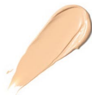
FAIR IS BEAUTIFUL