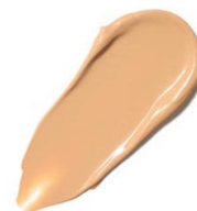
BEIGE IS BEAUTIFUL