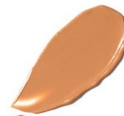
DEEP BROWN IS BEAUTIFUL