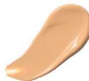
LIGHT BEIGE IS BEAUTIFUL