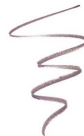
OFF AND RUNNING