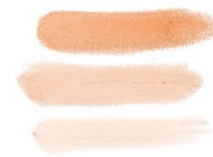
BELIEVE IN MAGIC