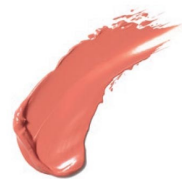
ROSÉ ALL DAY