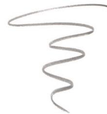
DON'T BACK DOWN