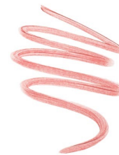
PARTNER IN CRIME