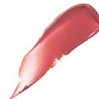
TIME AFTER TIME