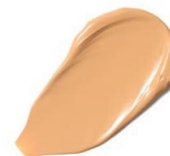
TAN IS BEAUTIFUL