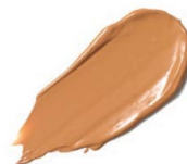
BROWN IS BEAUTIFUL