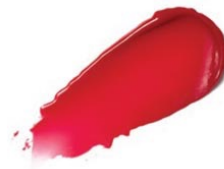
RUN THE WORLD