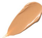
LIGHT BROWN IS BEAUTIFUL