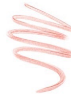
SUCH A FLIRT