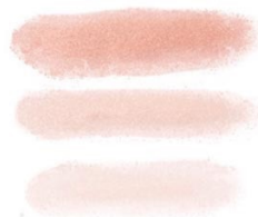
OUT OF THIS WORLD