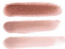
LIKE A DIAMOND