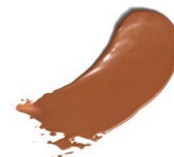
DARK BROWN IS BEAUTIFUL