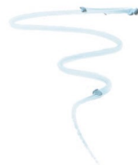
UP UP AND AWAY